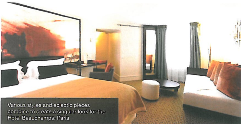
Various styles and eclectic pieces combine to create a singular look for the Hotel Beauchamps, Paris.