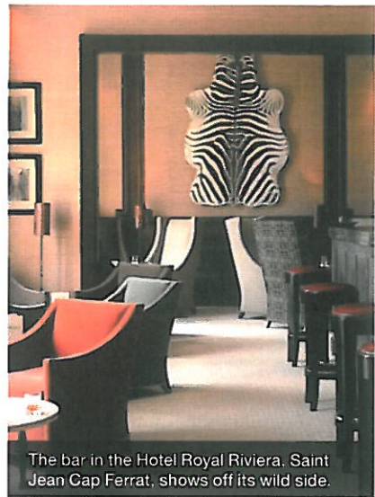
The bar in the Hotel Royal Riviera, Saint Jean Cap Ferrat, shows off its wild side.