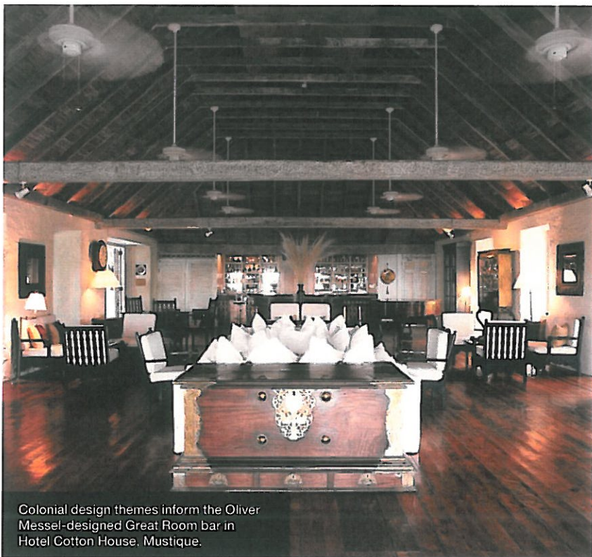
Colonial design themes inform the Oliver Messel-designed Great Room bar in Hotel Gotton House, Mustique.

range and commercial experience. The basic tools would be a preliminary presentation that's well organized and relevant, the usual design boards or mood boards. In the case of a bigger or more complex-scale project, a model is a great visual aid.