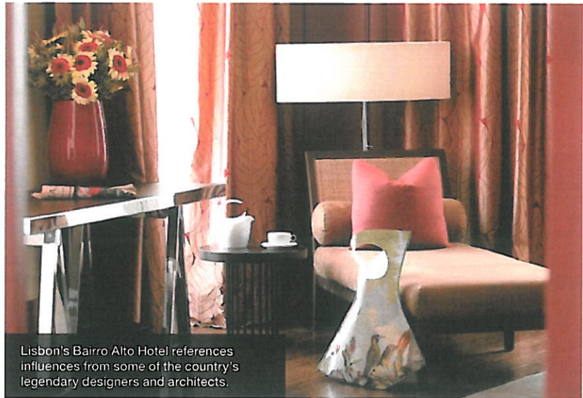
Lisbon's Bairro Alto Hotel references influences from some of the country's legendary designers and architects.

It's important to understand the customer