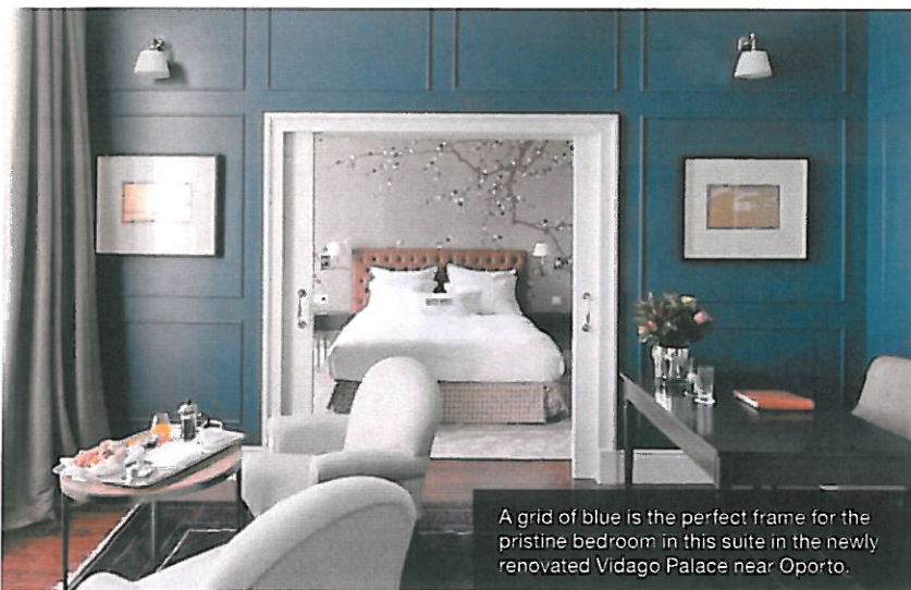
A grid of blue is the perfect frame for the pristine bedroom in this suite in the newly renovated Vidago Palace near Oporto.

You must be referring to commissioning [the French designer] Christian Liaigre when I did the Hotel Montalembert in Paris. Christian was relatively unknown when I hired him to help me to renovate this property. The younger generation knows from the media what good design is. So, I get a lot of submissions of their work. What impresses me is an overall design sensibility, how receptive the designers are, how well they listen. I want to know they'll interpret my vision and fulfill the design brief without being concerned by their own egos. I like someone who is a bit avant-garde and doesn't necessarily follow the